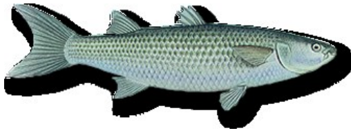
Mullet/Multe = 45 cm