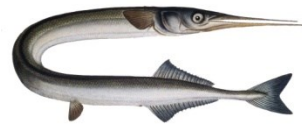
Garfish/Hornfisk = 45 cm