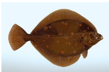
Flounder/Rødspætte = 30 cm