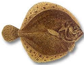
Turbut/Pighvar = 35 cm