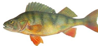
Perch/Aborre = 30 cm