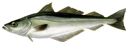
Pollack/Lubbe = 45 cm