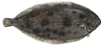
Sole/Søtunge = 30 cm