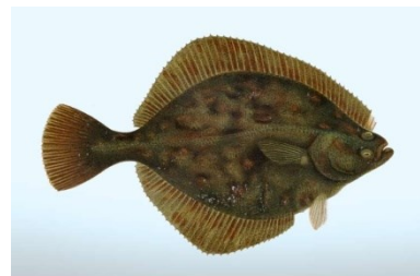
Flounder 2/Skrubbe = 30 cm