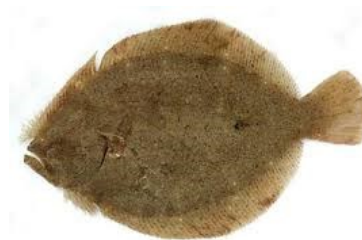
Brill/Slethvar = 35 cm