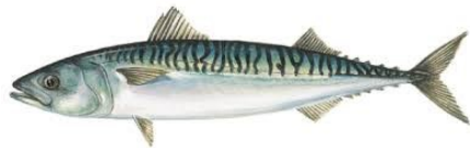
Makrel = 30 cm