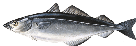
Coalfish/Mørksej = 45 cm