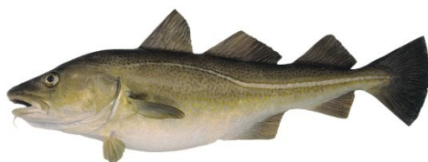
Cod/Torsk = 45 cm