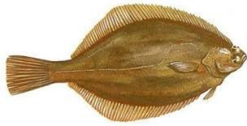
Dab/Ising = 30 cm